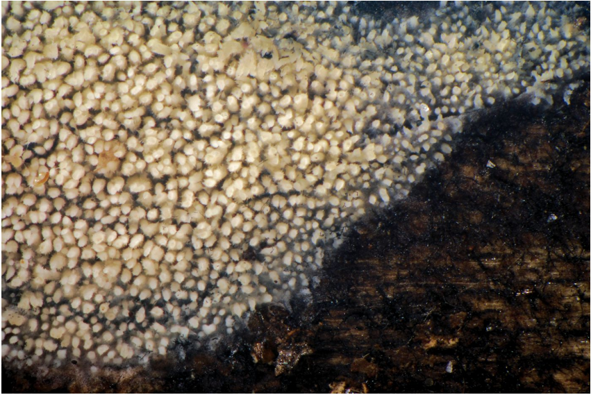
Fig. 3: Basidiome and margin. Image width = 9 mm [em-12245]