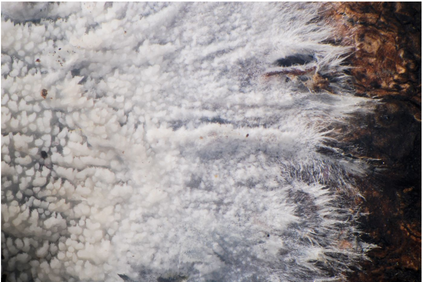
Fig. 4: Fibrillose margin. Image width = 9 mm [em-12245]