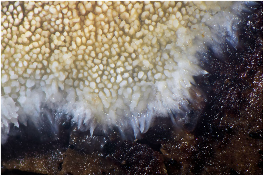
Fig. 2: Detail of the basidiome at the margin. Image width = 9 mm [em-12399]