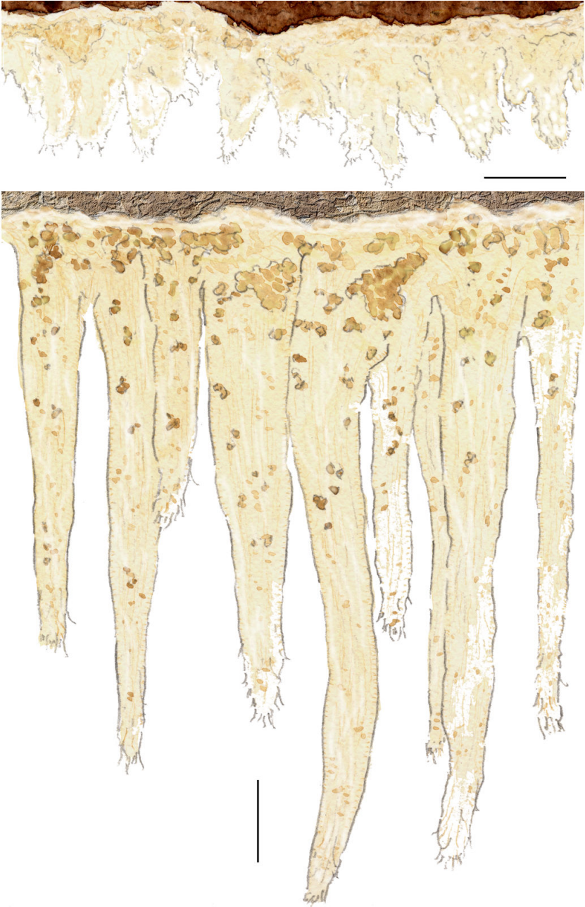
Fig. 5: Section through the basidiome: A) very young specimen [em-12906]. - B) mature specimen [em-1941]. - Bar = 0.2 mm